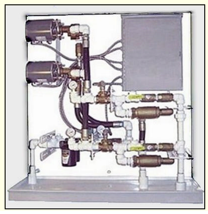
A wall mounted, duplex system pump set (Model #PYPS2200) with a large array of options. Pump sets may be ordered with or without an optional (#338) enclosure (open style shown here).

Pryco Pump Sets are high performance fuel system drivers. They are fully integrated, pre-plumbed and pre-wired for trouble-free, "connect and go" installation. We offer a wide range of configurations that will fulfill your requirements. They are intended to transfer #2 fuel oil within an emergency generator system or oil burners.