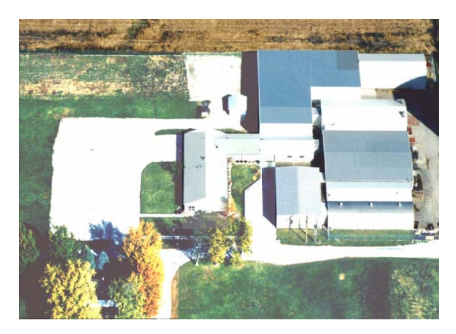
Over two acres under one roof is the home of Pryco — industry pioneers of safety, standards, and codes for fuel systems for emergency and standby power generation systems.